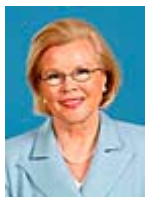
Minister of Justice Leena Luhtanen