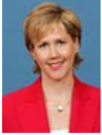
Minister of Social Affairs and Health Tuula Haatainen