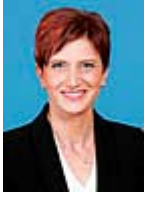
Minister of Transport and Communications Susanna Huovinen