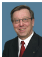
Minister of the Interior Kari Rajamäki