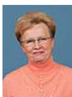
Coordinate Minister for Finance Ulla-Maj Wideroos