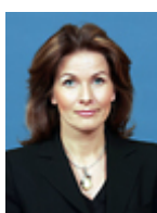
Minister of Culture Tanja Saarela