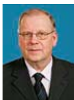
Minister of Regional and Municipal Affairs Hannes Manninen