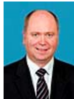
Minister of Finance Eero Heinäluoma