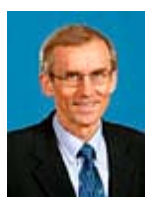
Minister of Education Antti Kalliomäki