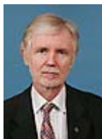
Minister for Foreign Affairs Erkki Tuomioja