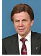
Minister of Trade and Industry Mauri Pekkarinen