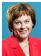
Minister for Foreign Trade and Development Paula Lehtomäki