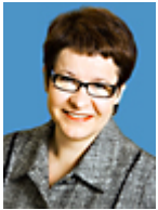
Minister of Labour Tarja Filatov