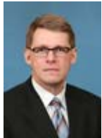
Prime Minister Matti Vanhanen

This sub-section introduces the Ministers of the Finnish Government. Photographs of the Ministers for editorial use can be found in the photo archive under Media Services.