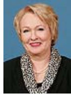
Minister of Health and Social Services Liisa Hyssälä