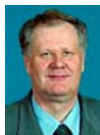
Minister of Defence Seppo Kääriäinen