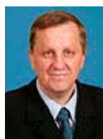
Minister of Agriculture and Forestry Juha Korkeaoja