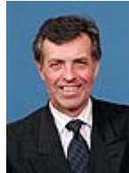
Minister of the Environment Jan-Erik Enestam