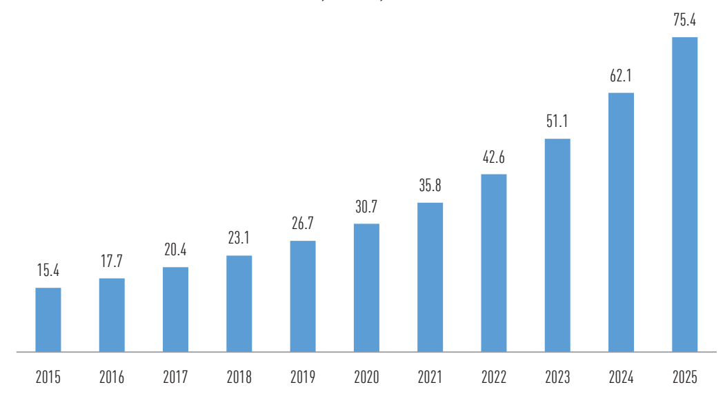
FIGURE 4 - Estimated number of connected devices worldwide, in billion, from 2015 to 2025