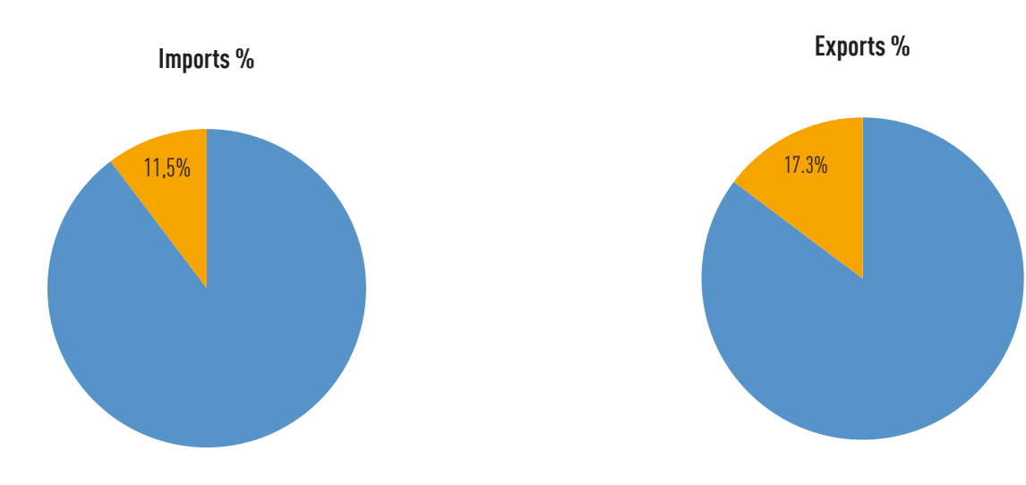
Figure 1 - US share of European trade: imports et exports

Trade between the US and the EU, corresponding to a total of almost $1 trillion, therefore represents approximately one third of world trade.