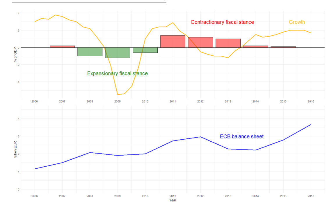
GRAPH 2 - Growth, fiscal stance and ECB balance sheet during the crisis

How does this compare to the fiscal policy response to the crisis? In Graph 1, we look at how national fiscal policies and the ECB each responded to the crisis. The top portion of the graph displays euro area quarterly growth rates (line) and the fiscal policy impulse ("fiscal stance", colored bars). Bars above zero indicate fiscal contraction, bars below zero indicate fiscal stimulus. The bottom portion displays the growth in the ECB's balance sheet over the same period, as a very rough overall proxy indicator of the size of the monetary stimulus.<sup>7</sup>