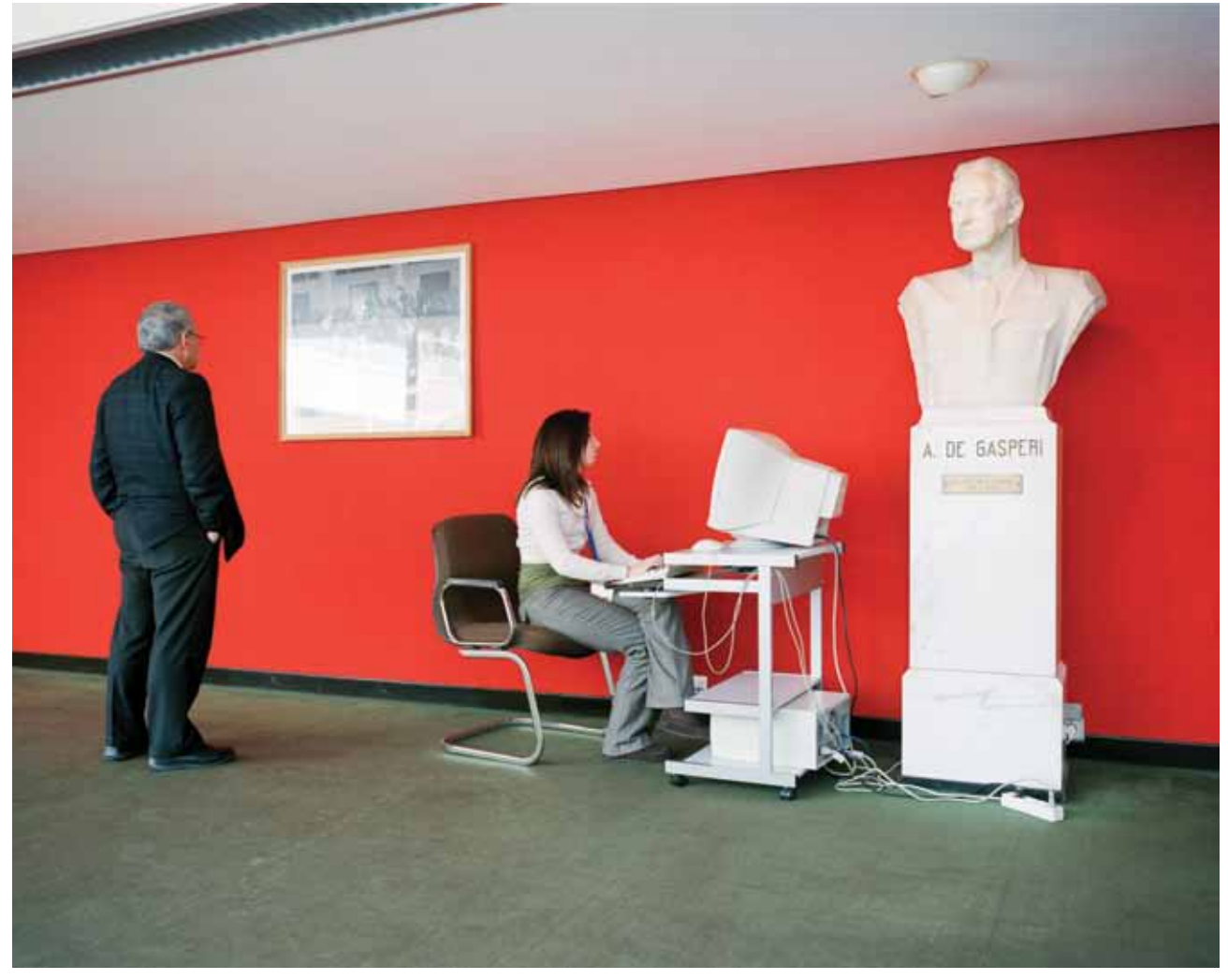
Strasbourg, 2007