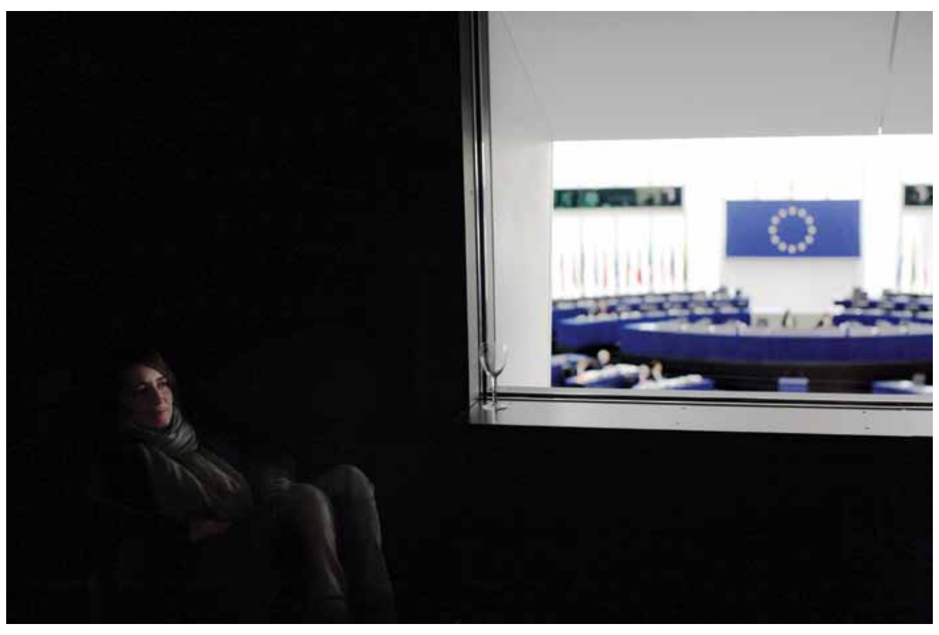
Strasbourg, 2009