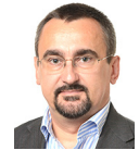
Czech Social Democratic Party