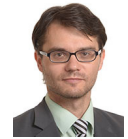
Mayors and Independents