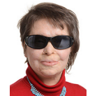
Coalition of the Radical Left