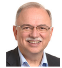
Coalition of the Radical Left