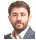
Panhellenic Socialist Movement - Olive Tree