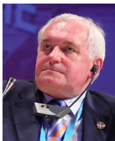
Bertie AHERN Former Prime Minister of Ireland (2013)