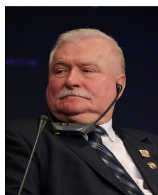
Lech WAŁĘSA Former President of Poland (2012)