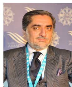
Abdullah ABDULLAH Former Minister of Foreign Affairs of Afghanistan (2010)