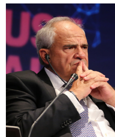
Ernesto SAMPER Former President of Colombia (2012)