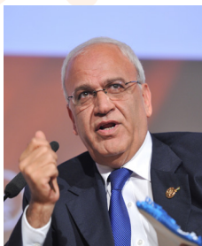
Saeb EREKAT Palestinian Negotiator in Chief (2010-2011)