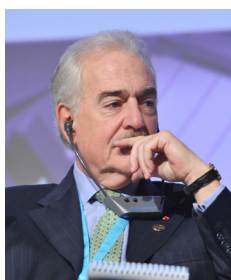
Andrés PASTRANA Former President of Columbia (2012)