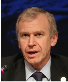
Yves LETERME Deputy Secretary General of the OECD (2013)