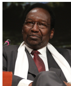
Dioncounda TRAORÉ Former President of Mali (2013)