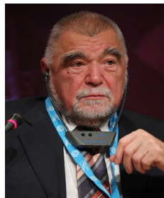
Stjepan MESIC Former President of Croatia (2013)