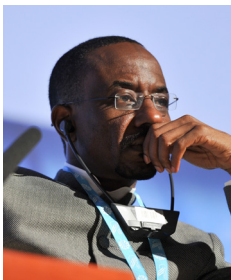
Sanusi LAMIDO Former Governor of the Central Bank of Nigeria (2011)