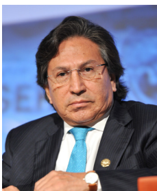
Alejandro TOLEDO Former President of Peru (2011)