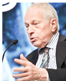
Edmund PHELPS Economy Nobel Prize Laureate (2010)