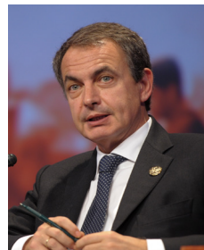
José Luis ZAPATERO Former Prime Minister of Spain (2012)