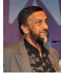
Rajendra Kumar PACHAURI Nobel Peace Prize Laureate (2010)