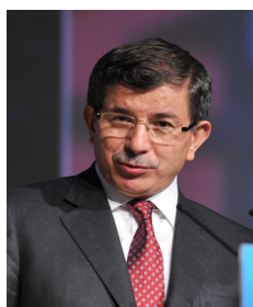
Ahmet DAVUTOĞLU Minister of Foreign Affairs of Turkey (2011)