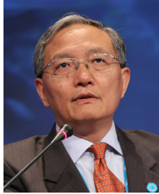
Zhong JINHUA Special Envoy of China for Africa (2012)