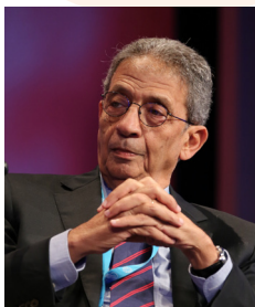
Amr MOUSSA President of the Egyptian Constituent Assembly (2012)