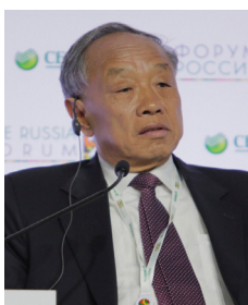
Li ZHAOXING Former Minister of Foreign Affairs of China (2010)