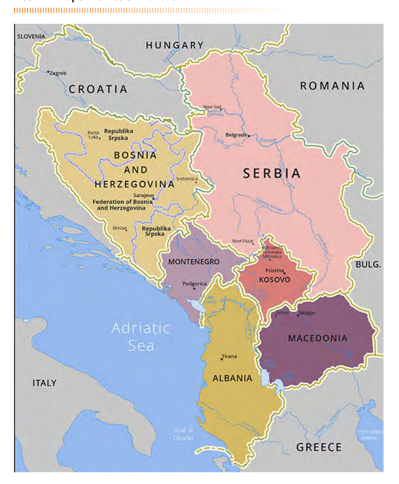
FIGURE 1 . Map of the Western Balkans

A first part focuses on the process of 'EUisation' of Western Balkans candidate countries through their approximation to EU cultural acquis in the enlargement process which encourages them to articulate their national cultural action with that of the EU. It presents the risk of overlooking the cultural differences of candidate countries, in the paradigm of self-defined "EU soft power and cultural superpower" and raises the question of an instrumentalization of culture by the EU as a foreign policy tool. 7 The second part assesses Western Balkans' participation to EU cultural programmes. It puts forward an EU priority to create an independent cultural sector in its partner States which is beneficial to the affirmation of their cultural diversity, but shows that EU cultural programmes are less sensitive to the specificities of Western Balkans's cultural environment than to their EU-like programmes. The last part looks more specifically at EU's attempts to translate the objectives of its Strategy for International Cultural Relations in the region (socio-economic development, cultural heritage preservation and reconciliation by intercultural dialogue). Such encompassing objectives are colliding with the realities of the region marked by multiplicities of identities, making it almost impossible for the Strategy to reflect them all. The EU then falls in the pitfall of overlooking minorities which might raise as obstacles to the enlargement process.