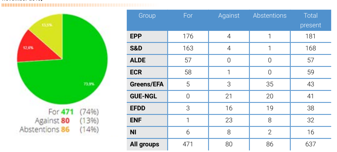
FIGURE 2 - An example of voting at the European Parliament which illustrates this divide: "WTO: the way forward" voting (29 November 2018)

In both cases, and at the risk of oversimplifying, the bias of national withdrawal opposes