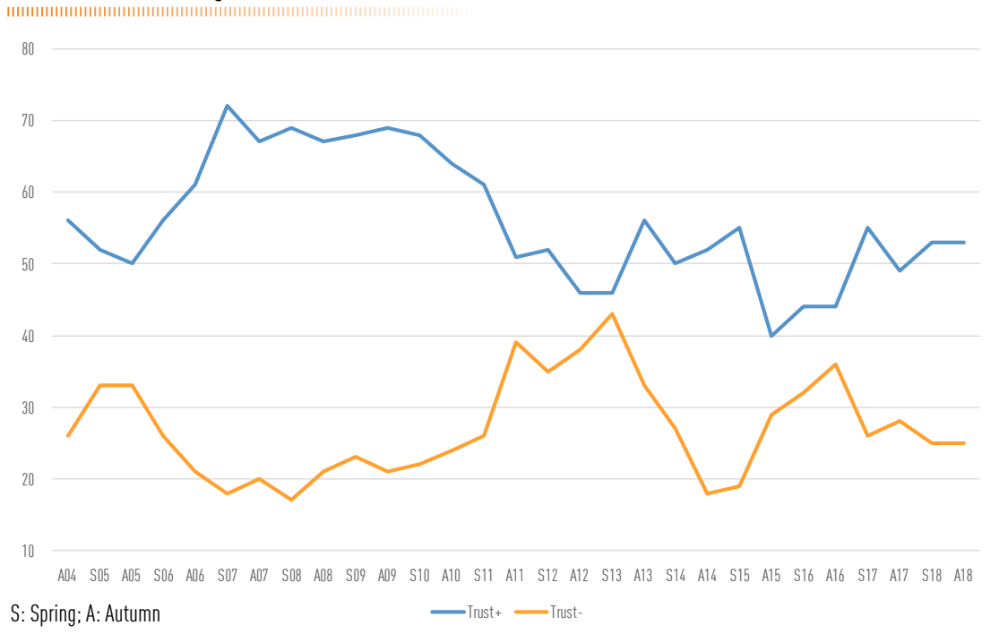
FIGURE 2 Estonia: degree of trust in the EU

Initial views on the direction being taken in the EU were extremely positive, 63% (versus 8%) regarding it as good. These decreased significantly, with some fits and starts, to the point where the negative and positive opinions were equal (29% and 29%, with 32% of neutral opinions in autumn 2012). A slight re-