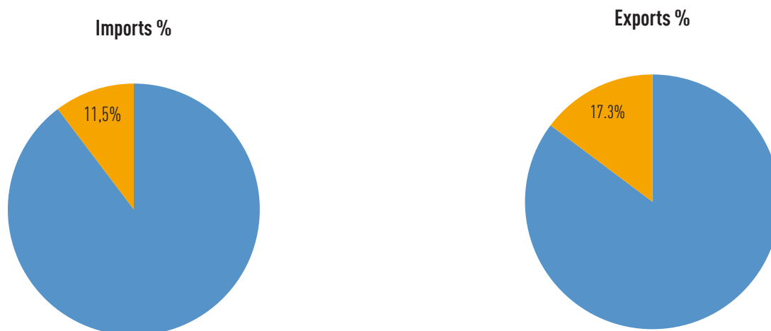
Figure 1 ► US share of European trade: imports et exports