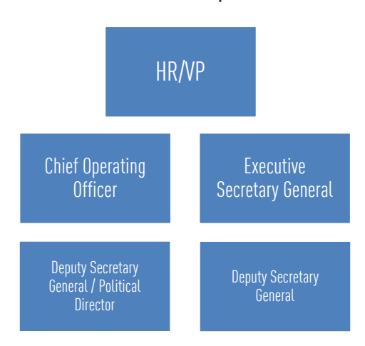
FIGURE 2 - Structure of EEAS Corporate Board