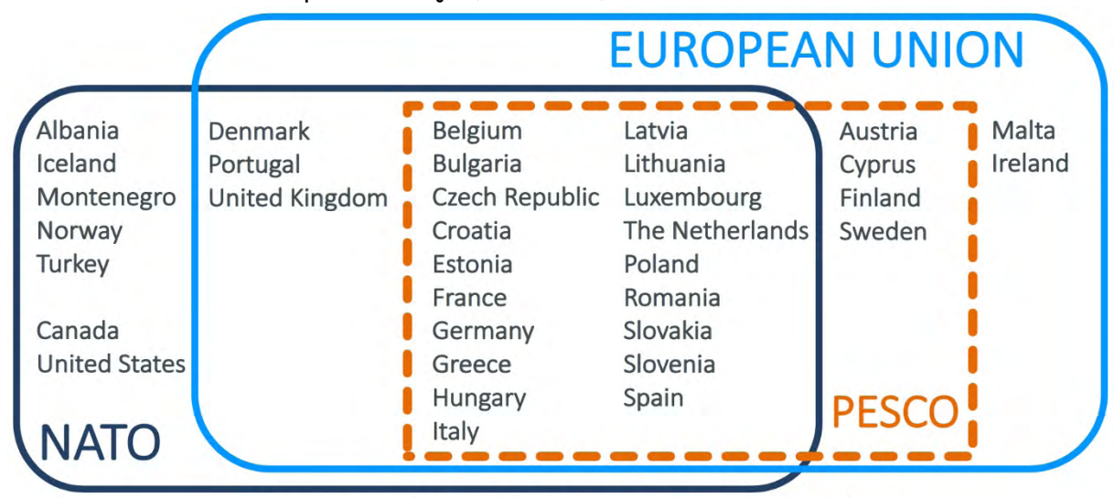
FIGURE 2 - Permanent Structured Cooperation in one figure (November 2017)

Infographic: Valentin Kreilinger, Jacques Delors Institut – Berlin, 13 November 2017. PESCO: EU Member States that signed the joint notification. It is possible for EU Member States to join at a later stage.