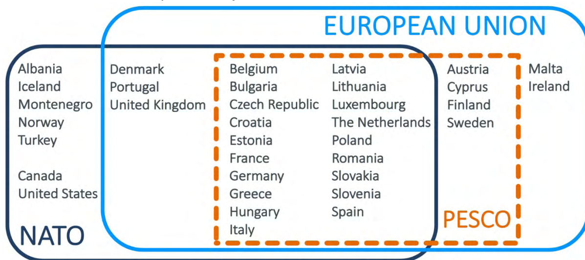
FIGURE 2 ► Permanent Structured Cooperation in one figure (November 2017)

Infographic: Valentin Kreillinger, Jacques Delors Institut – Berlin, 13 November 2017.