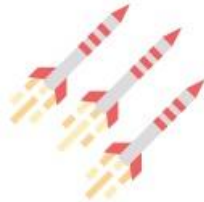
Conventional arms control