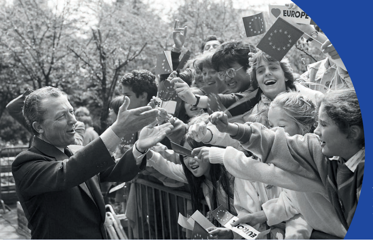
Jacques Delors greeting the crowd at the ceremony to inaugurate the adoption of the European flag, 29 May 1986.